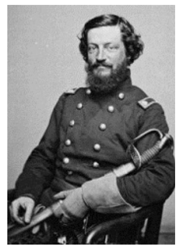
Mormons as early as 1846, and in his honor they named their new community after him.

merchandisers, would travel to the Valley in 1850, but at this point the market didn't seem to be strong enough to outfit a trip. Since many of the pioneers were descended from thrifty New England stock, they would have carried what they knew they could to trade once they arrived in Salt Lake.